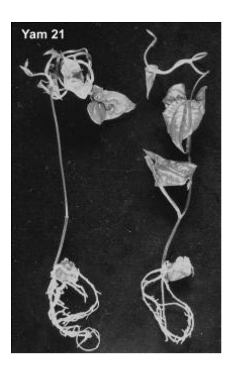
Figure 1: Latest morphological developmental stages of Yam 16 ( D. bulbifera L and Yam 21 ( D. oppositifolia L.) after 5 weeks of in vitro introduction using aerial tubers.