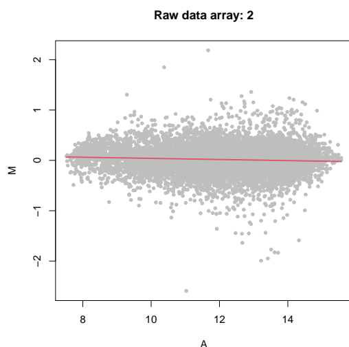
Figure 2: Normalization of array data using pspline: Normalization of the swirl microarray data using the pspline-function, the fit to array two is shown